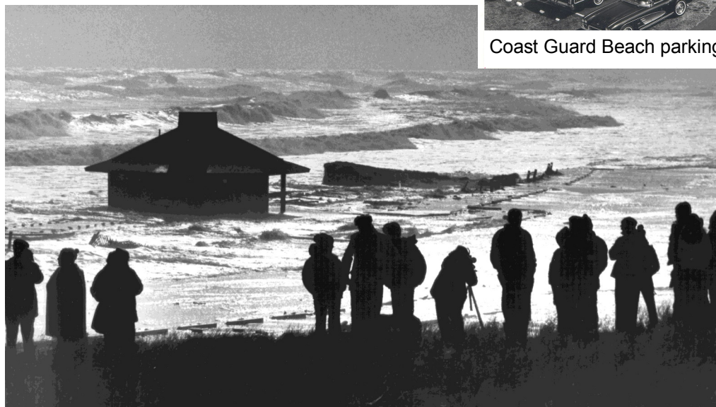
Blizzard of 1978 destroys Coast Guard Beach