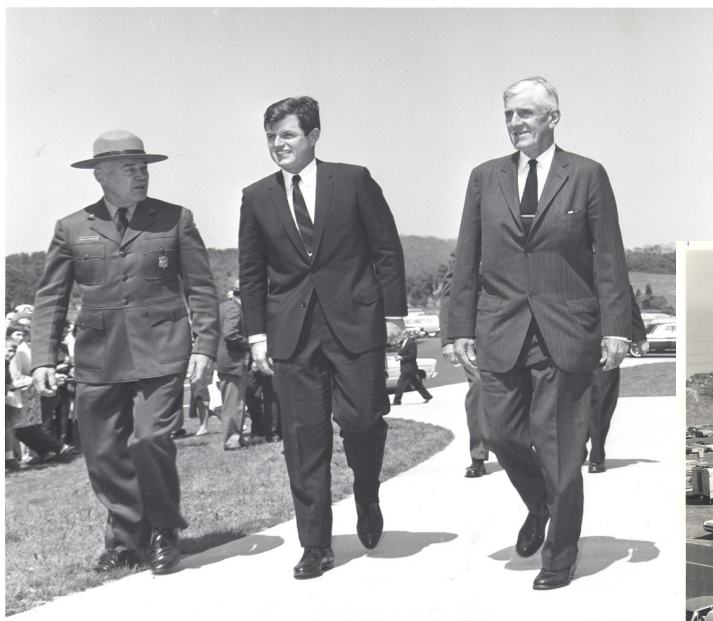
Senator Edward Kennedy and Senator Leverett Saltonstall arriving at the opening of Salt Pond Visitor Center May 1965

Celebrations were held at the Salt Pond Visitor Center in Eastham, the Province Lands Visitor center in Provincetown and Highland Light in Truro.