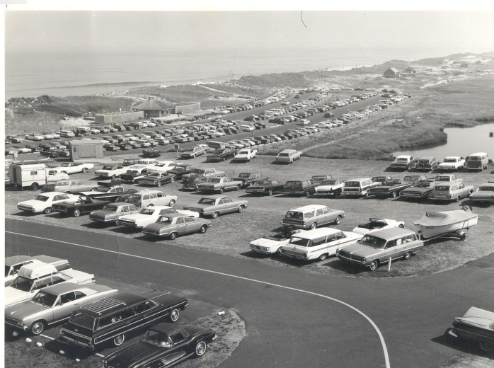
Coast Guard Beach parking lot and bathhouse - 1960s